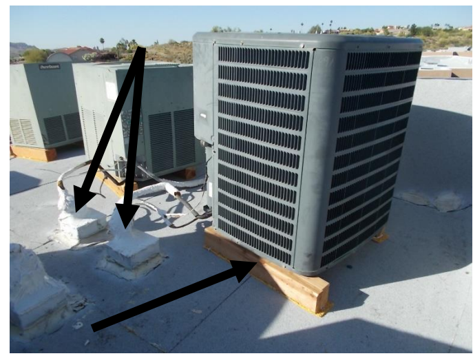
Do not disturb the existing wood support blocks and reuse if at all possible.

When replacing an HVAC unit or a TV dish mounting platform on a building that has a low-slope roof system, it is imperative that great care is taken to not damage the existing roofing system. This can be accomplished in several ways.