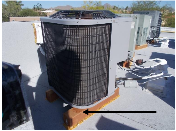
Do not disturb the existing wood support blocks and reuse if at all possible Protective slip sheets should always be installed between the roof system and any type of equipment platform or support.