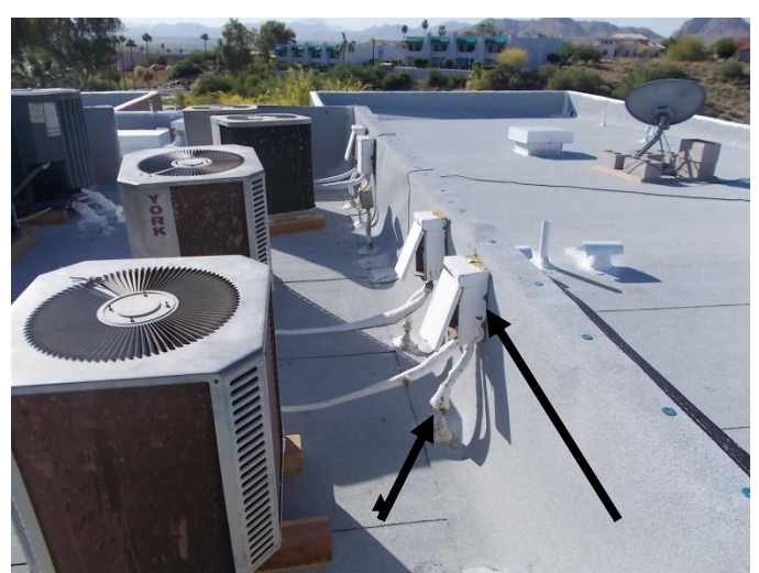
Take great care to seal around any roof penetrations that may be needed and/or any existing roof penetrations that are disturbed. Make sure the disconnect box is properly sealed around.