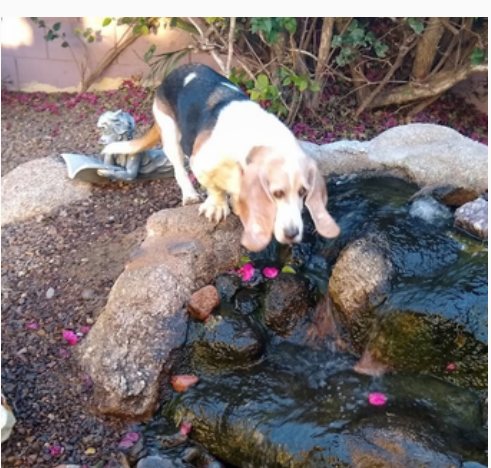
Daisy Mae sipping out of my fountain

I served on the HOA Board for several years, including 2 as President. Several important things we got done during that time included finally getting sub meters to the patio homes. Before that, 6 homes would be on one meter and the bill was divided by 6. A single person would have to split the water cost with neighbors who had pools and several residents. Another big project was the complete redo of the patio deck at the pool. Termites had totally infested all the pilings resulting in a complete tear down. A very fun thing, which I would like to do again, was an open house home tour. About six people opened their homes to show off their creative remodeling results. It was a great way to get ideas.