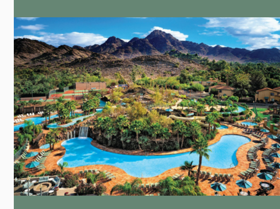
River Ranch Waterpark Reservations

For individual requests contact Selma Dzananovic at 602-678-5920 or Selma.dzananovic@hilton.com (cc: Kathleen.bellevue@hilton.com)