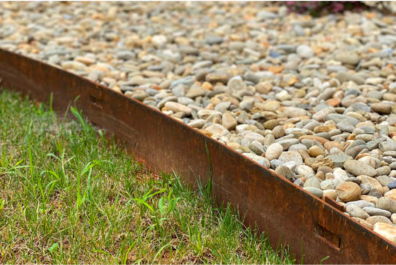
METAL / STEEL EDGING