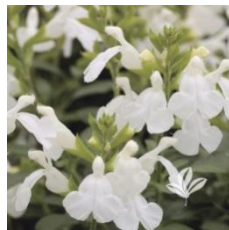
flower on white autumn sage